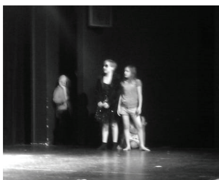
The ugly sisters hide Cinderella from Prince Charming

They had all come along to see the students' versions of a reduced pantomime. This is like a normal pantomime that includes all the traditional elements but is much shorter! The Theatre was filled with shouts of, "He's behind you!" and "Oh, yes he is. Oh, no he isn't!" The Year 7 students had been